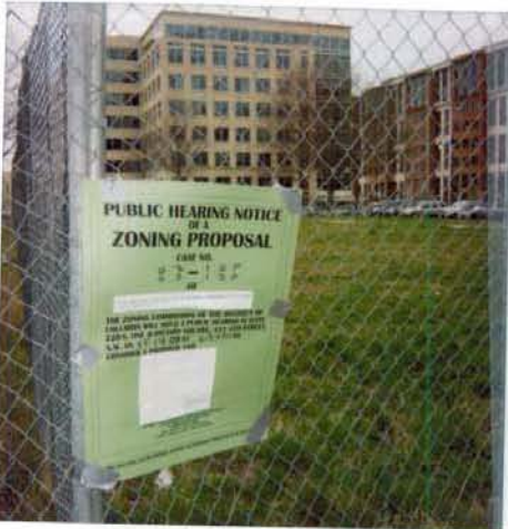
200 Block of 2nd St SE 21 ZC 03-12F 03-13F