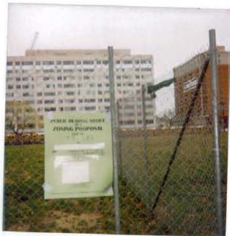
200 Block of 3rd St, SE 200 3rd St ZC 03-12F 03-13F