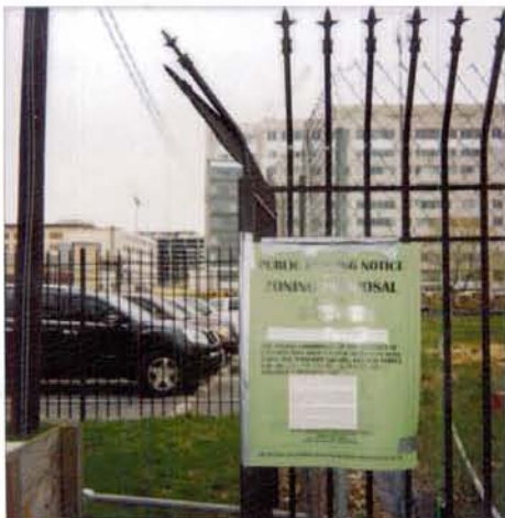
200 Block of 3rd St, SE 200 3rd St ZC 03-12F/03-13F