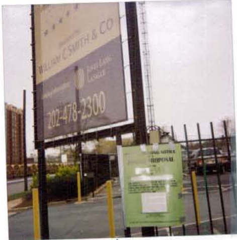
250 M Street SE ZC 03-12F/ 250 M Street SE 03-13F

ZC 03-12F/03-13F Square 769 and OCHA Modifications to PUD of Sq 769. Lot 18 20-021