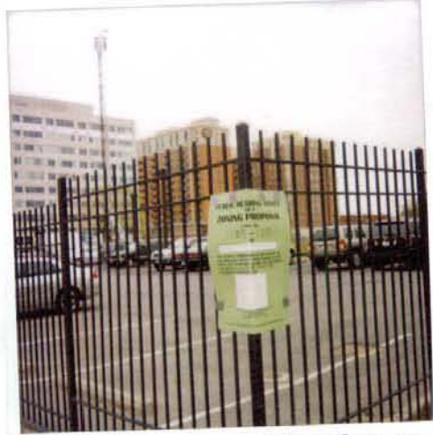
250 M Street SE ZC 03-12F 250 M Street SE 03-13F