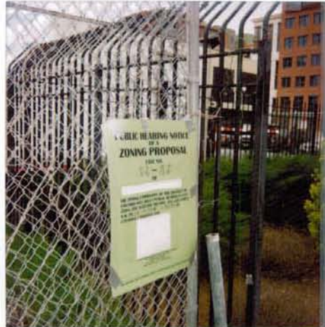
200 Block of 2nd St SE ZC 03-12F/03-13F